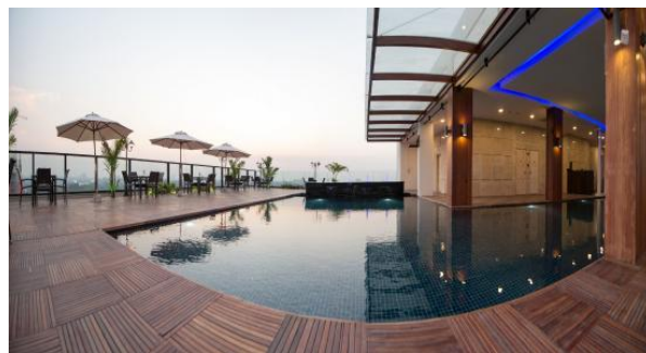
Hotel Parami - Rooftop Swimming Pool