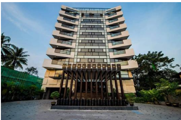
Stay at Hotel Parami

St Clements University Myanmar College has organised a range of graduation packages for international graduates who wish to participate in this first St Clements University Myanmar College Graduation Convocation. The Graduation will take place at the Gandamar Grand Ballroom – near the Hotel Parami where accommodation will be available. There are a selection of packages ranging from attending the Convocation and participating in the Lunch for $US280 plus $US100 for guests, to a 3 day event incorporating the Graduation, a day of touring Yangon at a cost of $US750 and $US570 for guests staying in a separate room or $US380 if sharing the same room.