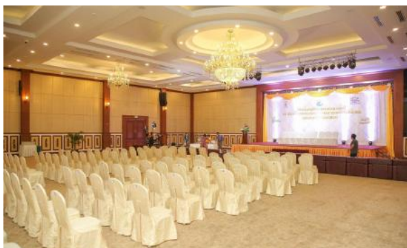
Convocation in Gandamar Hall