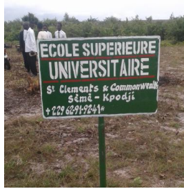
Sign Board of the University