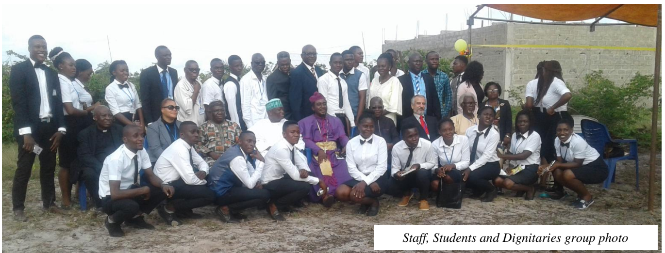
Staff, Students and Dignitaries group photo