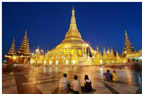
Visit the Shwedagon Pagoda