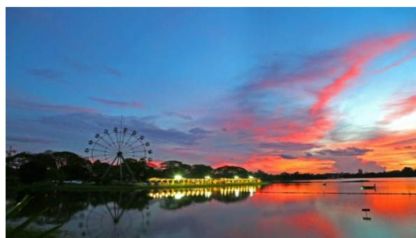
Inya Lake, Yangon

If you are interested in attending this event or require any further information please contact St Clements Education Group administration at admin@stclements.edu