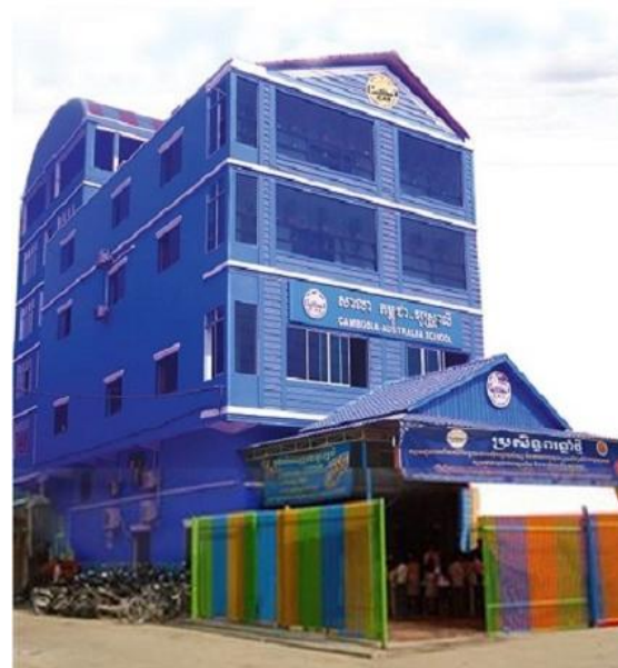
New St Clements Institute premises (above) and previous campus building (left).

Over the past six years that we have held our Sub-Decree (No. 150 ANKR.BK) we have received many negative opinions about this building and the Board of Directors knew that someday the St Clements Institute had to move to a more suitable place.