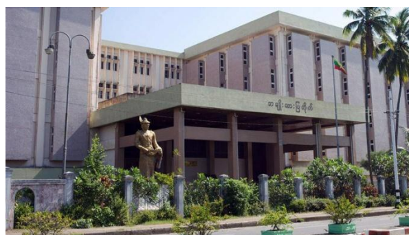
National Museum of Myanmar