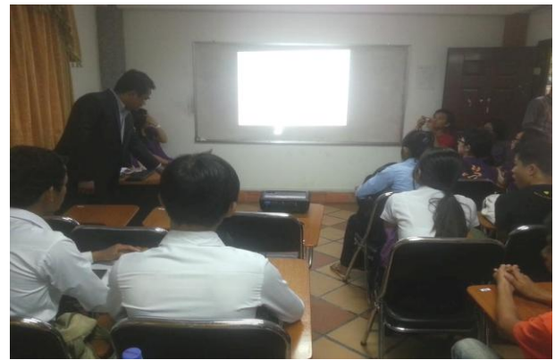
Activities (above) with foreign students from Hong Kong.