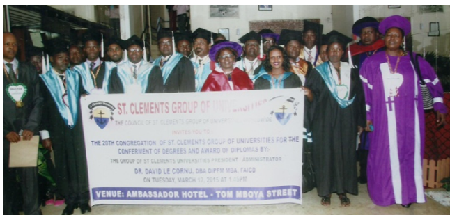
St Clements Education Group Graduands.