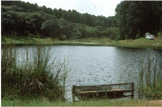
Mature commercial pine planting

In one Central African country he is working with African nationals who have practical skills and business experience to develop an export timber business utilising a large stand of commercial pine trees that is ready for harvest.