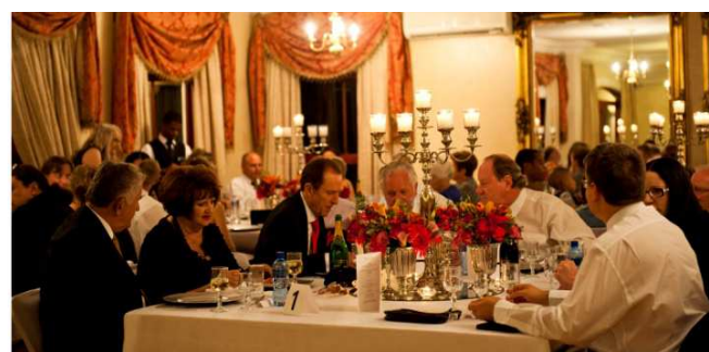
Guests enjoying celebratory dinner.