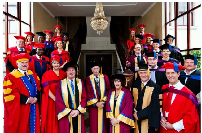
2015 Graduation Convocation Group