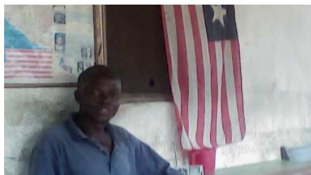
Todee Clan's Chief with Liberia Flag in his meeting spot.