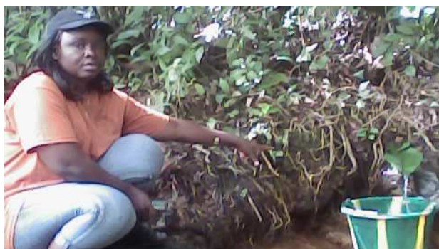
Water point where the entire Community drinks from. One of the students drawing water from the source.

Result: Each group was given an opportunity to have their field experience presented while questions were asked by their colleagues.