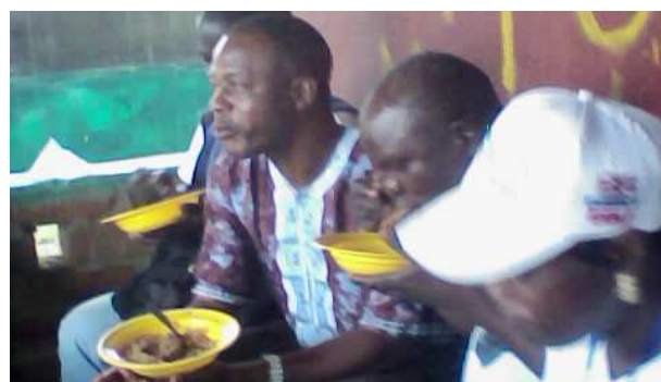
Students having refreshments after the trip.

It was a rewarding experience for the entire class as they met face to face with theoretical issues discussed in class. Most importantly, some of the students were born in Monrovia city, an urban centre, and have not been to a rural community to see the conditions the rural dwellers are struggling to survive on a daily basis.