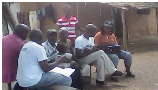
Students conducting interviews with some of the rural dwellers.