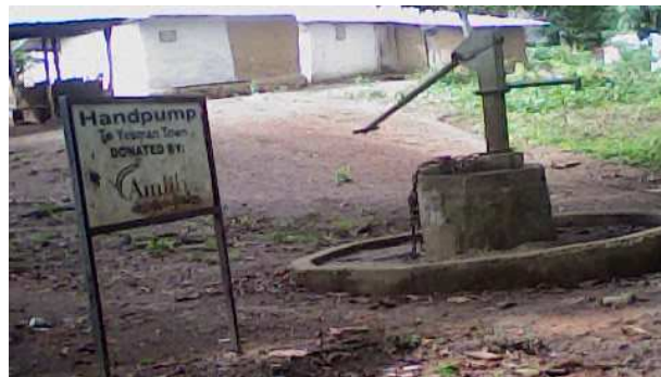
Non-functional hand pump donated by Amlib Liberia, a gold-mining firm.