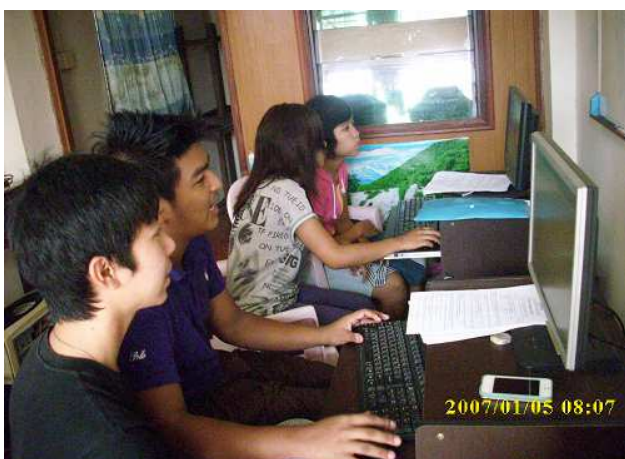
Students of Highlight Computer Group