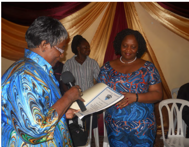
The Honorary Chancellor of St Clements University College giving Senator Taylor her 'Friend of St Clements University College' Certificate.