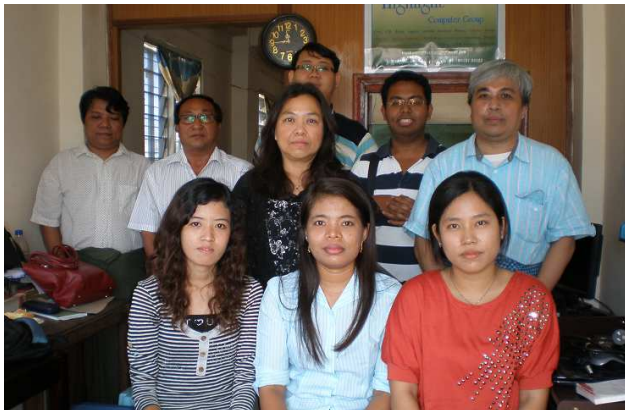
Highlight Computer Group Teachers