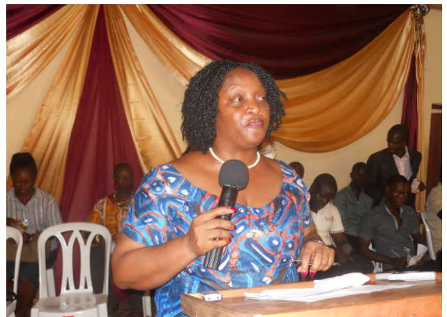
Senator Taylor addressing the students.