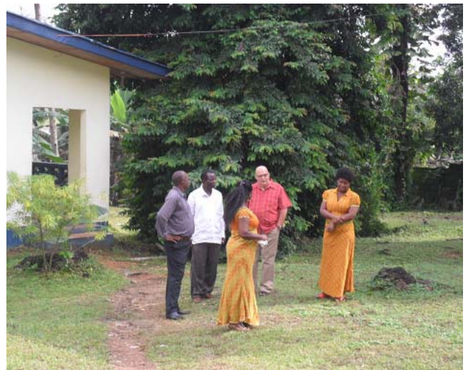
A view of the campus gardens.