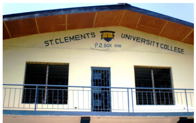
A view of the campus building.