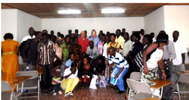
First semester students of St Clements University College celebrating the end of their first semester.