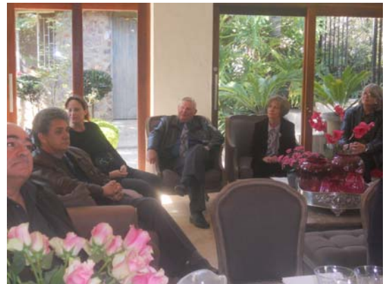
Râdâh Board and some students