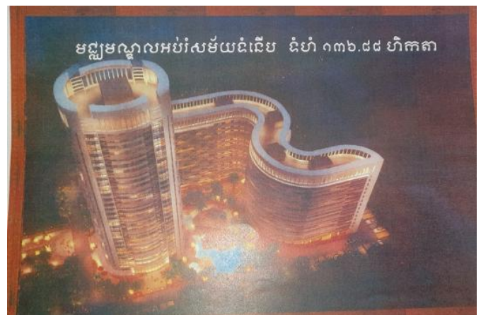
This is the proposed University building in Cambodia