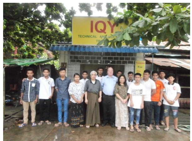
Staff and some St Clements University Myanmar College Students